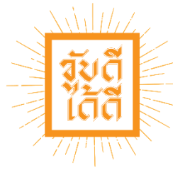
Campaign name and logo

ทำดีได้ดี “TAM-DEE-DAI-DEE” (Do Good Get Good) ↓ ขับดีได้ดี “KUB-DEE-DAI-DEE” (Drive Good Get Good)