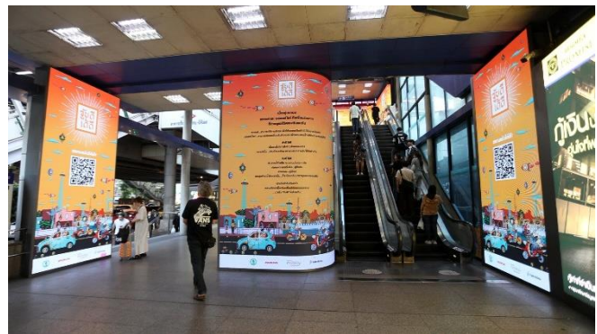
OOH during the pilot phase

Based on these results, during the Songkran phase, messages will be communicated in line with Songkran, a period when traffic accidents increase significantly during the year, with the prevention of drunk driving positioned as one of the key themes. In addition, the LINE Official Account will serve as a new communication platform for delivering traffic safety content and introducing mechanisms that encourage continued participation. Participants engage with daily updated traffic safety content, allowing them to enjoy learning while earning points. Through these continuous touchpoints, the campaign aims to deepen understanding of traffic safety and provide an opportunity for people to reflect on their daily behavior.