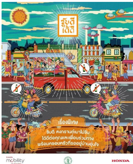
Key visual for Songkran