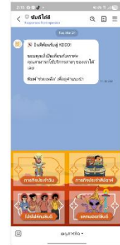
LINE Official Account

Looking ahead, TMF also aims to link this initiative with the results of data analysis from TRUST (Thailand Road Users Safety through Technology), the traffic safety project it is promoting in Thailand, and to develop it into a framework for highly effective, data-driven traffic safety measures.